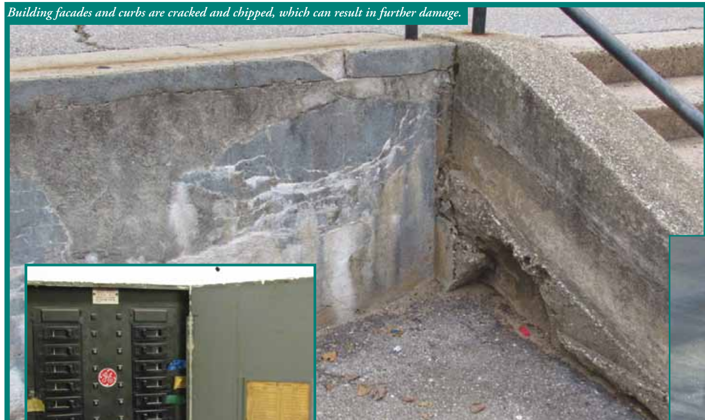
Building facades and curbs are cracked and chipped, which can result in further damage.