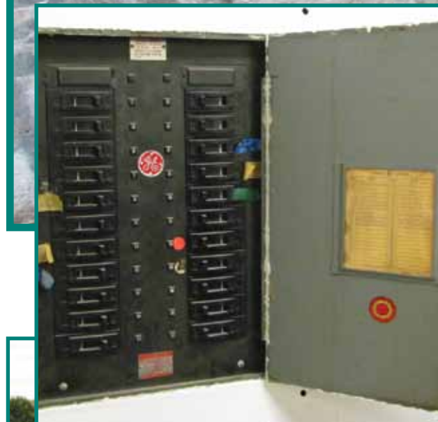
Many existing electrical panels and supporting cabling were installed more than 70 years ago, when less electricity was used.