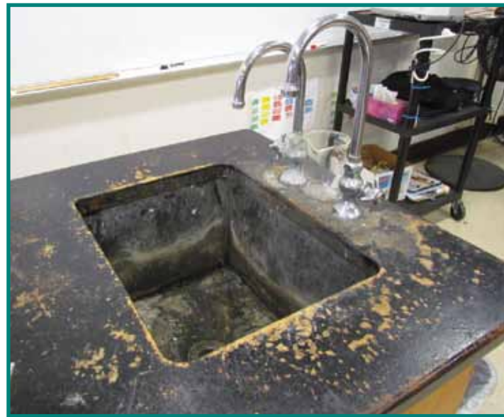
In addition to aging equipment, as evidenced in this photo from a lab at North High School, room layouts are no longer consistent with the evolving curriculum requirements and advancements in science.