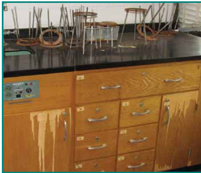
Science labs have significantly aged, with outdated equipment and furniture. This is a photo of a lab at Central High School.

Sample of Work to Be Completed Through an Approved Bond