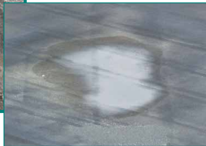
Roofs were last replaced in the mid-1990s and have begun to pose problems such as ceiling leaks.