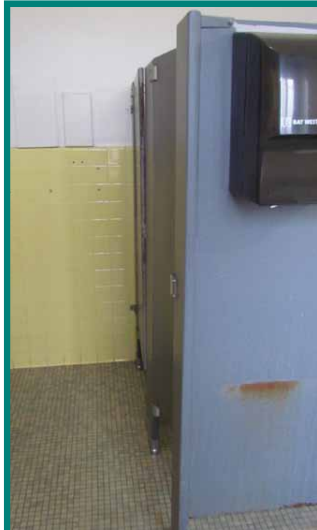
Most bathrooms were installed over 60 years ago and have rust, peeling paint and aged equipment.