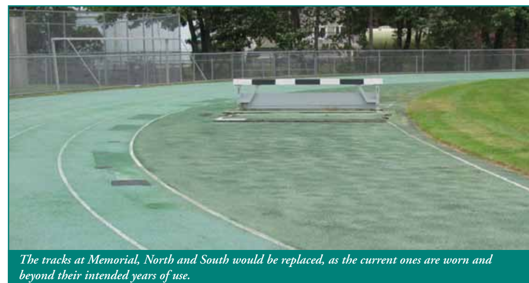
The tracks at Memorial, North and South would be replaced, as the current ones are worn and beyond their intended years of use.