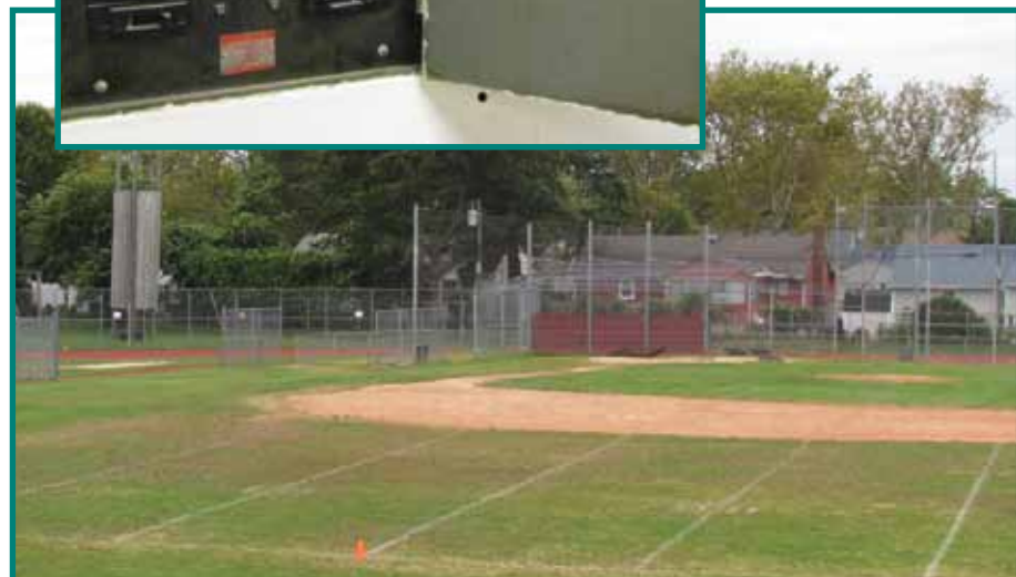
Multi-sport turf fields would be installed at North, South and Memorial. The district would most likely install synthetic turf fields coated with CoolFill, which are common in neighboring schools.